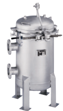
Eaton Maxiline™ vessels holds up to eight filter bags.

Also, in situations where a cartridge filter user wants to convert to a CIP system but cannot for whatever reason, bag filters may provide a compromise solution. Bag filters generate 10-15 times less solid waste than cartridges, and they require less labor for media changeout. Plus, some bag filters can be cleaned and reused, lowering waste and disposal costs even further. Bag filters can also be used in conjunction with CIP filter systems when processors want to recycle the waste liquid containing the solid contaminants. Installing a bag filter in the waste line removes contaminant from this fluid and allows it to be recycled back into the process.