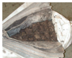
Graded density bag filters provide high dirt holding capacity for less frequent changeouts.

The products being removed from a liquid process stream are as widely variable as the types of filters designed to remove them. Products being removed in potable water treatment applications are often molecular in size. However, many other filtration applications are concerned with the