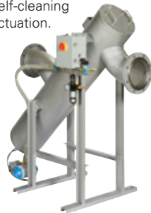
High Flow MCS uses magnetically coupled, self-cleaning actuation.

Also, in situations where a cartridge filter user wants to convert to a CIP system but cannot for whatever reason, bag filters may provide a compromise solution. Bag filters generate 10-15 times less solid waste than cartridges, and they require less labor for media changeout. Plus, some bag filters can be cleaned and reused, lowering waste and disposal costs even further. Bag filters can also be used in conjunction with CIP filter systems when processors want to recycle the waste liquid containing the solid contaminants. Installing a bag filter in the waste line removes contaminant from this fluid and allows it to be recycled back into the process.