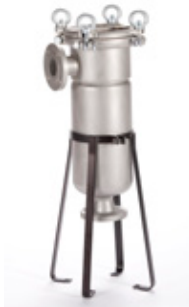
Eaton Flowline II™ Single bag filter housing

filters can both remove suspended solids for applications with lower flow rates, where exposure to the process liquid is not a problem, and where lower volumes of solids must be removed. Bag and cartridge filters are roughly equivalent in price, while CIP systems tend to cost more initially. However, users should consider the total operating costs of a filtration system, not merely the initial purchase