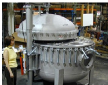
Eaton Maxiline bag filter vessels are designed for flow rates up to 4400 gallons per minute—excellent for pre-filtration protection of downstream equipment and process integrity.