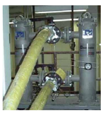
Duplex cart system on new building start-up, Times Square, NY