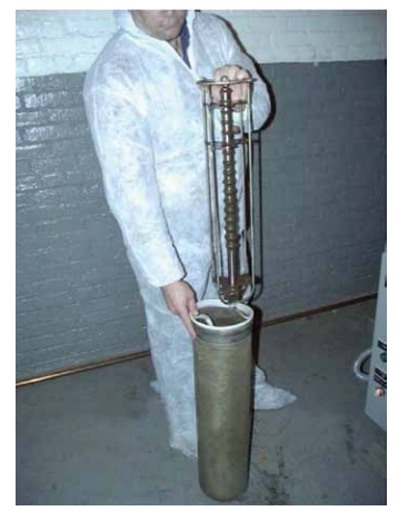
LOFNETIC Magnetic Inserts

Eaton also recommends the optional LOFNETIC™ Magnetic Insert accessory for increasing the dirt collecting capacity of filters in HVAC systems.