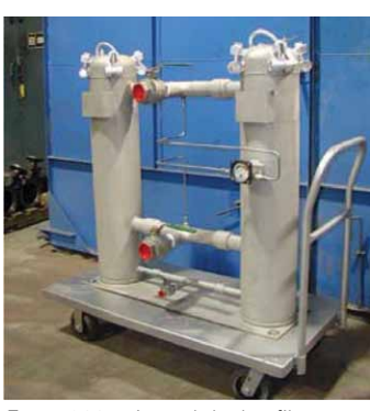
Eaton 300 psi rated duplex filter cart

Model 2596 Automatic Self-Cleaning Cast Pipeline Strainers provide continuous flow, simplified maintenance, and worry-free operation