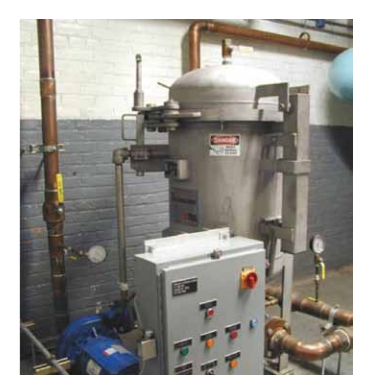
Filter Package with Pump and Control Panel

Because extending the time between filter bag change-outs saves money in filter costs and labor, Eaton's DURAGAF™ Extended Life filter bags are