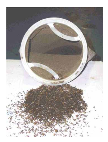
One #2 DURAGAF filter bag with collection of iron oxide "chip scale"

simple effectiveness and their significantly lower cost in comparison with alternative automatic backwashing systems like sand filters. One reason is that sand filtration cannot easily remove particles that have a higher specific gravity than the sand media itself. The typical iron oxide chip scale and corrosion debris that causes the biggest problem in today's HVAC piping systems cannot be backwashed out of sand filters.