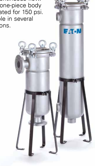
The FLOWLINE II™ is perfect for operations not requiring continuous flow. Its unique one-piece body design is rated for 150 psi. It is available in several configurations.

MCS-1500 is perfect for high-capacity straining. Magnetically coupled actuation allows for quick and easy access for maintenance, reduces potential leaks, and requires few moving parts.