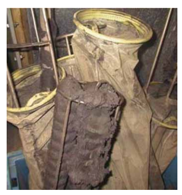
Debris removed from one Eaton filter using magnetic inserts and DURAGAF bags