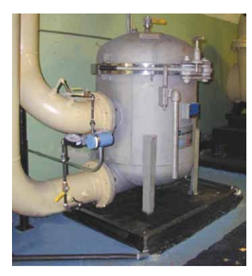
Eight bag Quick Closure vessel cooling loop, Penn Plaza, NY